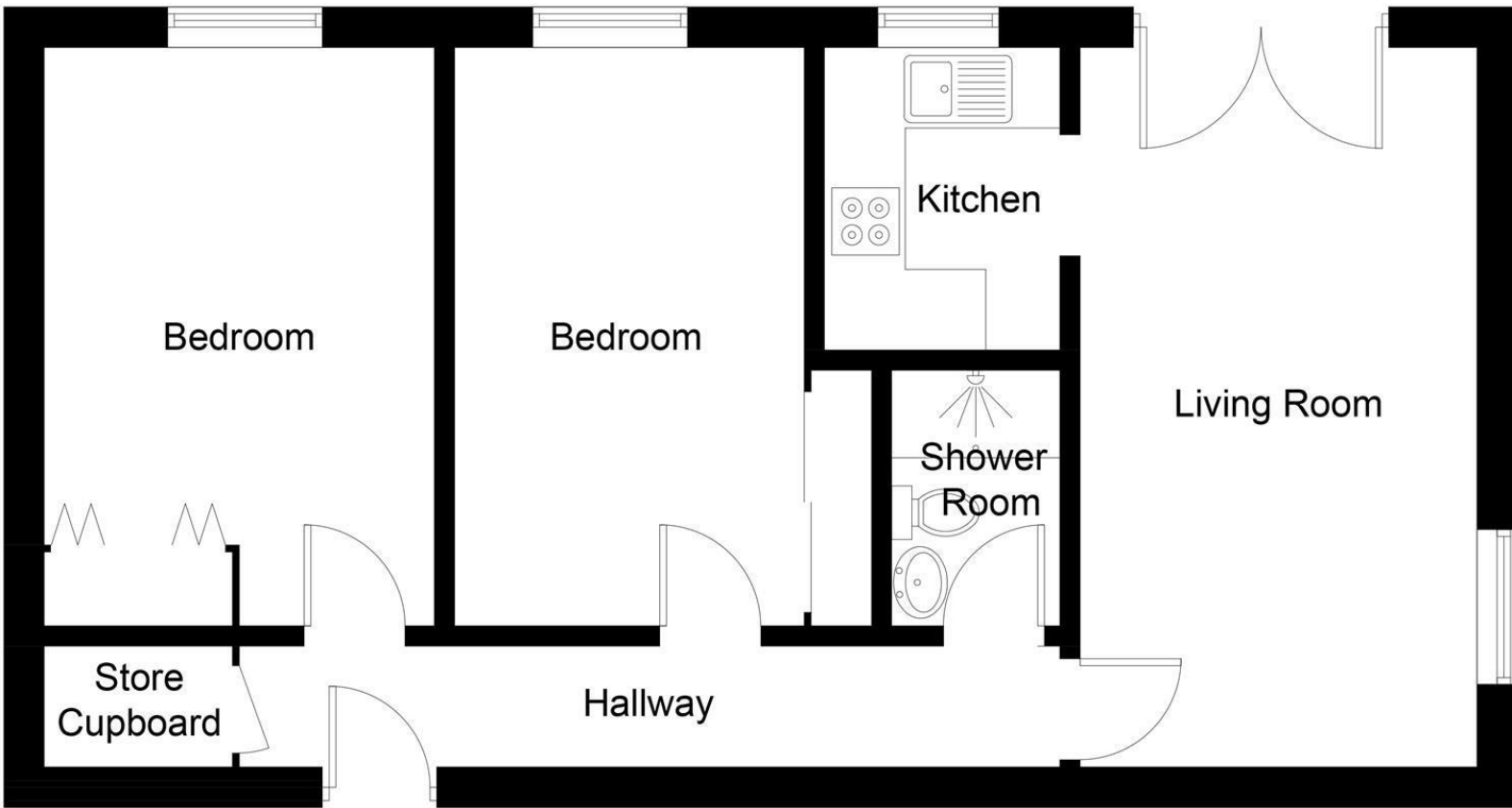
Illustration for identification purposes only, measurements are approximate, not to scale. Fourlabs.co © (ID1275894)